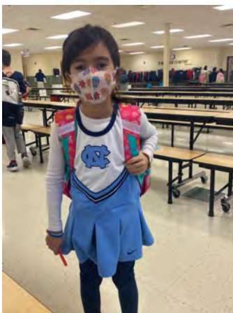
She's ready to cheer on the Tarheels!

Our book fair was a HUGE success, as you'll see on the next page of the newsletter, and it couldn't have been done without volunteers! We are working on planning for next year's book fair and hoping to grow the book fair committee. If you loved the book fair and want to be more involved with it, please email the PTC . Thank you!