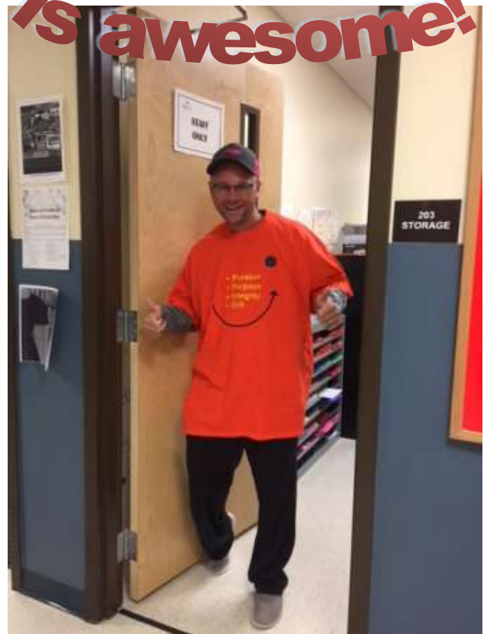
Pep Rally on Friday!